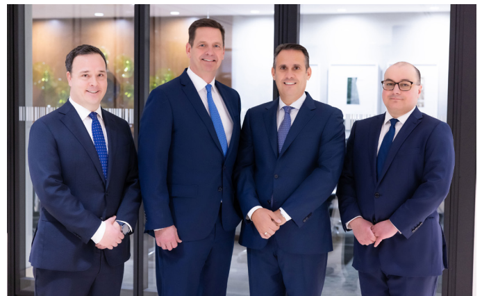
MK Total Wealth Management Group TD Wealth Private Investment Advice