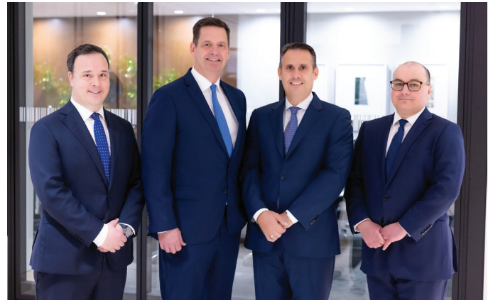
MK Total Wealth Management Group TD Wealth Private Investment Advice