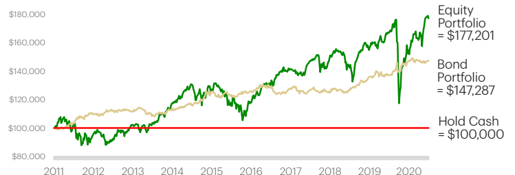
Chart 2: Investing in Equities vs. Bonds vs. Holding Cash, 2011 to 2020

Sources: Equities: S&P/TSX Composite TR Index, Bond Portfolio: Core Canadian Government Bond Index ETF, 1/1/11 to 12/31/20.